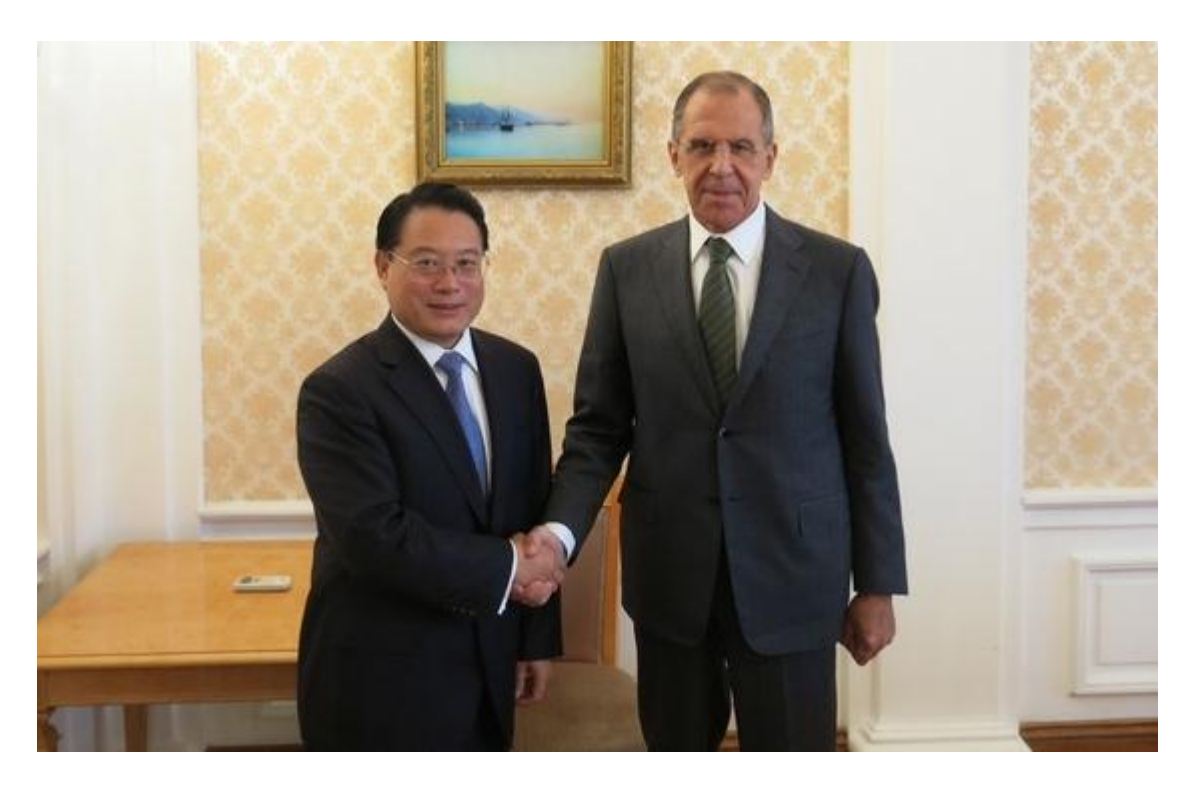
DG, Li Yong and H.E. Mr. Sergey Lavrov, Minister of Foreign Affairs of the Russian Federation

The DG attended an official lunch with MR. GENNADIY GATILOV, Deputy Minister of Foreign Affairs of the Russian Federation. The Deputy Minister expressed his appreciation for the DG's visit to the Russian Federation and his satisfaction with UNIDO project implementation, including the first project in Africa funded by the Russian Federation – the establishment of a fishery institute in Sierra Leone. The Deputy Minister also referred to the importance of international cooperation, citing the example of the BRICS platform and the importance of the work of diplomatic community in Vienna on institutionalization of the BRICS platform in Vienna and in UNIDO in particular, and in this connection the establishment of a UNIDO BRICS cooperation unit, and that this work should continue in terms of defining possible project portfolio, funding sources, mechanisms of implementation and monitoring and should define concrete milestones. The development of projects within the BRICS platform would promote UNIDO activities on strengthening the industrial base and on knowledge sharing and technology transfer within the group and beyond.