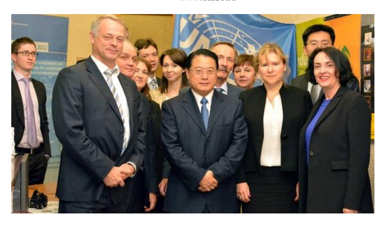
DG and UNIDO Delegation visited the UNIDO Center for International Industrial Cooperation (CIIC)

THE DIRECTOR GENERAL'S MEETING WITH THE PRESIDENT OF THE RUSSIAN UNION OF INDUSTRIALISTS AND ENTREPRENEURS (RSPP) AND THE PRESIDENT OF THE INTERNATIONAL CONGRESS OF INDUSTRIALISTS AND ENTREPRENEURS (ICIE)