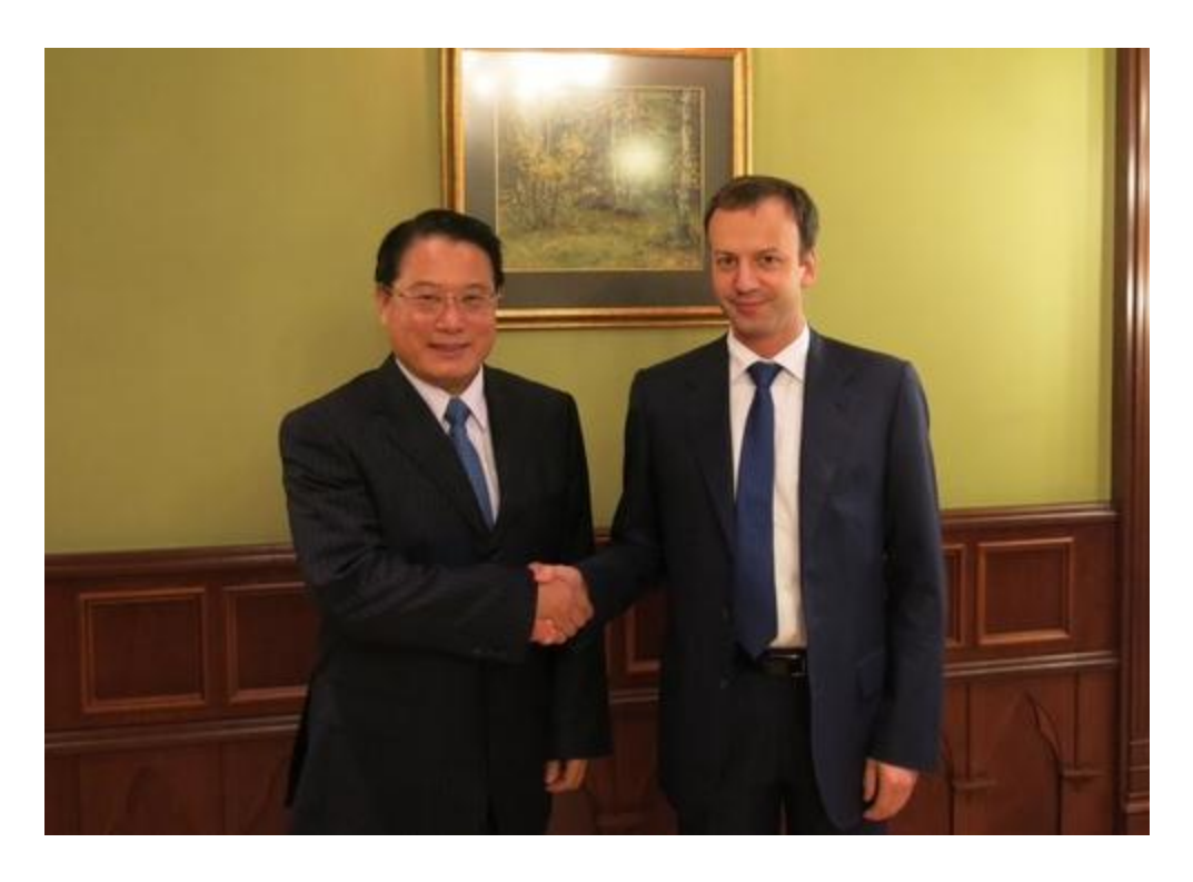
DG, Li Yong and HE Mr. Arkady Dvorkovich, Deputy Prime Minister of the Russian Government

Prime Minister also expressed the wish to expand cooperation between the Russian Federation and UNIDO to areas such as innovative technologies, water remediation, renewable energy, food security, industrial clusters and skills' upgrading. Waste management is also particularly important for the Russian Federation, given the legacy of industrial pollution from the Soviet period. The DG discussed his new vision for UNIDO, namely inclusive and sustainable industrial development and the importance of the upcoming General Conference in Lima during which Member States will adopt the Lima Declaration.