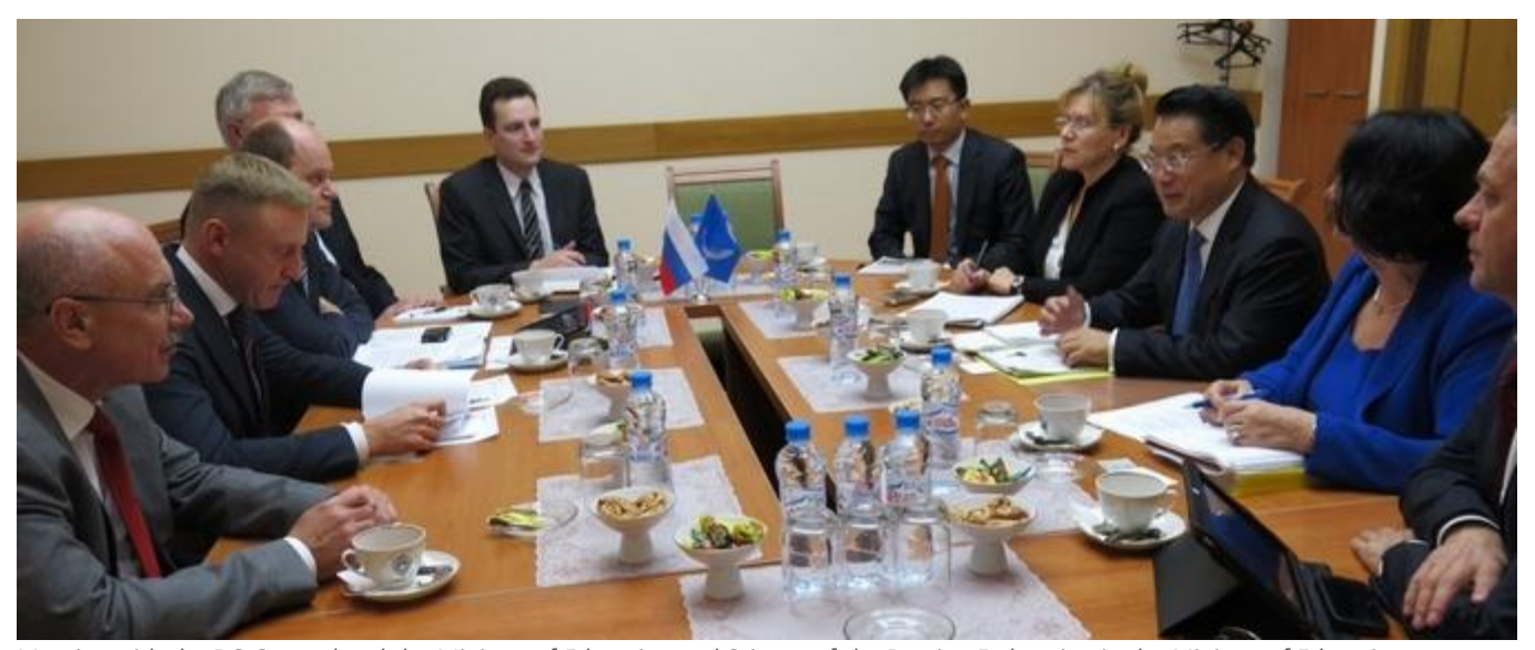
Meeting with the DG General and the Minister of Education and Science of the Russian Federation in the Ministry of Education and Science of the Russian Federation, Moscow

agenda. Finally, the DG briefed on the General Conference in Lima and expressed his hope for Russian high —level participation in the work of UNIDO General Conference.