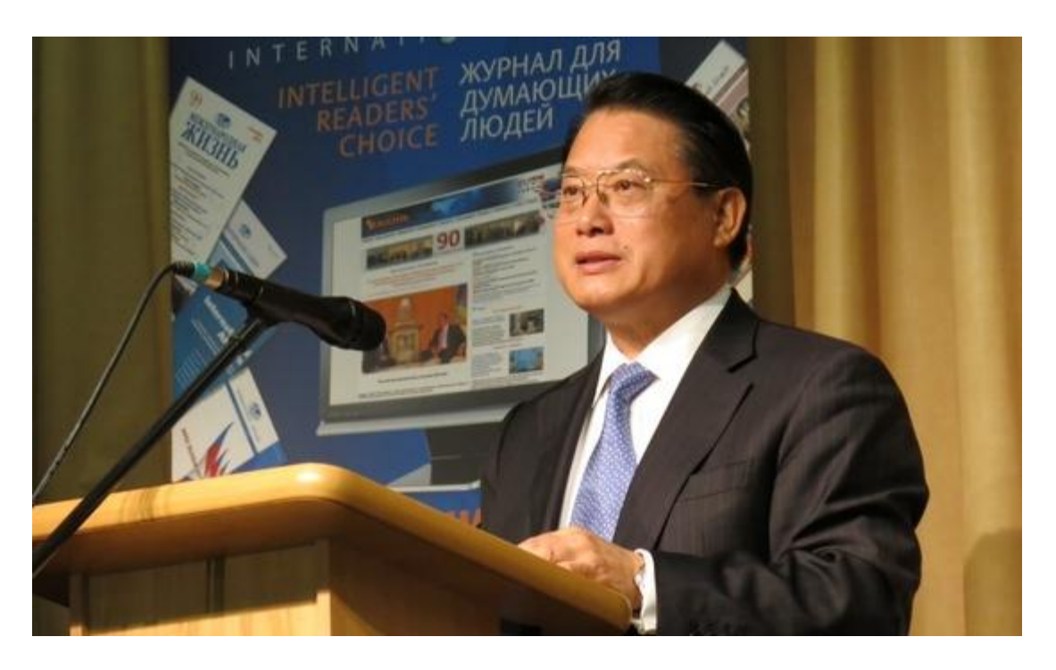
The DG also gave a keynote speech at the Ministry of Foreign Affairs, within the framework of the 'Golden Collection' project for the journal "International Affairs," on the vision for UNIDO's future as well as on cooperation with the Russian Federation